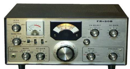
Yaesu FR50B Rx

Do come along and join in the fun of using a great mode of operation.