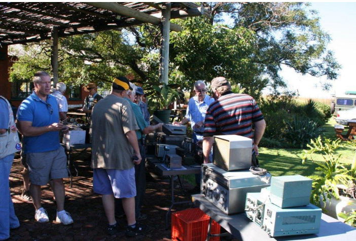
Eager Onlookers with some of the fine rigs for sale.