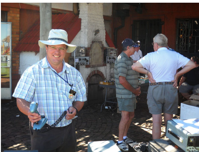
So where does this go ? Check the legs in the background !!

In many HF transceivers the driver valve is the 12BY7A, which is a television video amplifier valve pressed into service as a RF amplifier. In colour television service the highest video frequency is about 6MHz. In order to get sufficient gain at higher frequencies some manufacturers run the 12BY7A well above the manufacturers ratings and hence they are dissipating a lot of power, in some cases more than twice the manufacturers maximum rating. This radically shortens the life of the valve and leads to low output power as the gain falls off. Some manufacturers also put a shielding can over the valve; this decreases the life even more as the anode runs at a very high temperature. I have seen 12BY7A anodes glowing red with just the idle current; they are running in full Class-A. Often a suspect pair of 6146s giving less than rated power is simply due to a tired 12BY7A driver being unable to drive the output stage fully. So before you condemn the 6146s try a new 12BY7A. Note: Alternatives to the 12BY7A are the 12BV7A and the 12BQ7A, these are all interchangeable without any components changes. The European equivalent is the EL180.