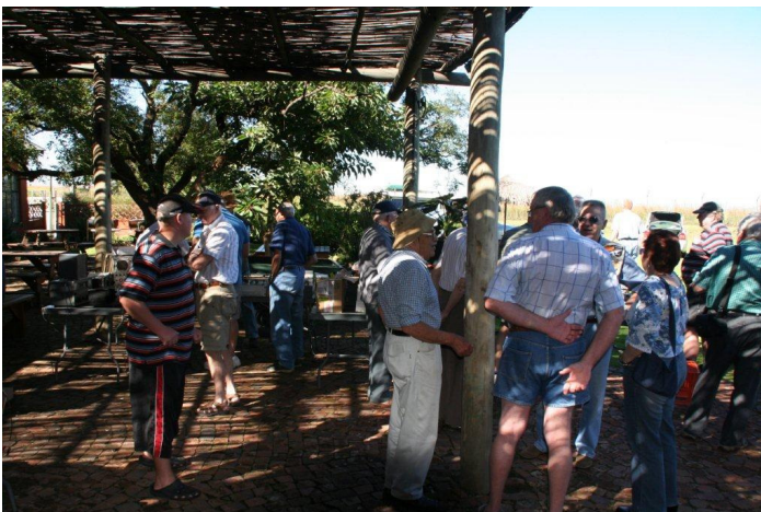
The Gathering Under the shade at the TAC