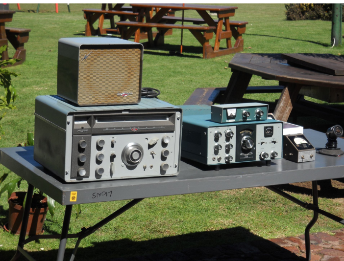
Some of the wonderful boatanchors on sale