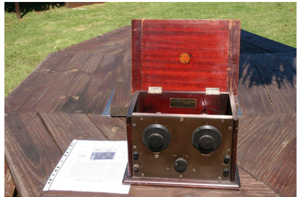
A Fine example of antique wireless. Richard's 1926 Marconiphone