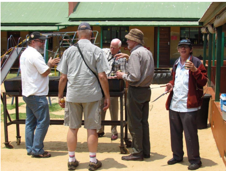
The gathering around the braai fire while traditional burning of raw meat takes place. That is for some, while others enjoyed bread out of a tin.

There being no further motions or points for discussion, the meeting was closed and all those present were thanked for their attendance.